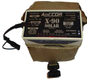
AP13038 - X-90 Pouch Slick