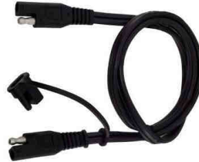
AP13027 - SAE Extension Cable, -24", -36", or -8'