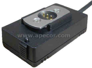
AP13029 - PRC-148/152 (MBITR) Battery Charging Smart Cable