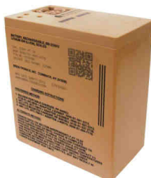
AP13048 - BB-2590 216Wh - 3.1 lbs