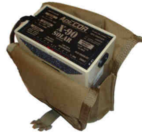
AP13038 - X-90 Pouch Deluxe