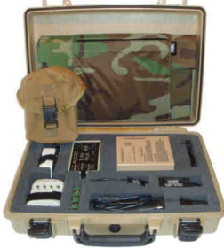
AP13040 - Scout Kit Bravo