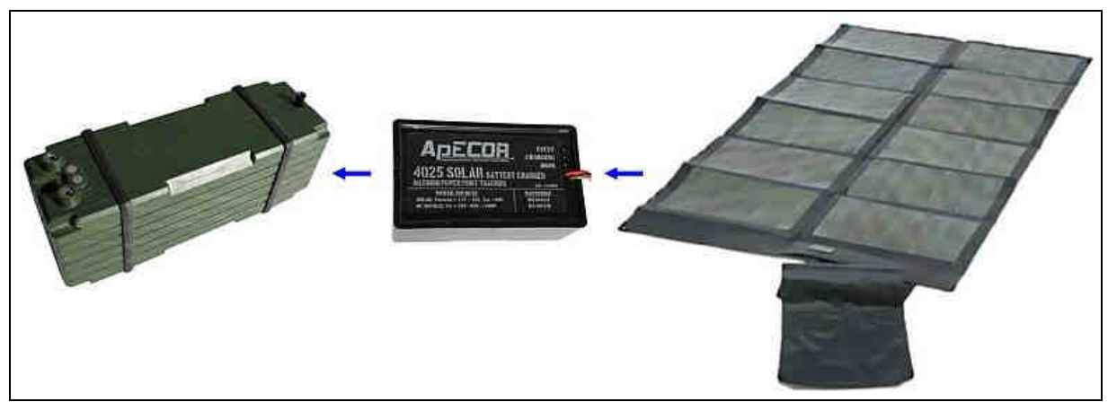
Figure 2: MA-4025 Solar charging a Mathews MA-4025 battery using the Global Solar P3-62W/24V panel